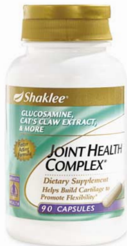
Joint Health Complex* 90 capsules #20668

Joint Health Complex improves the cushioning in joints for more comfortable movement, flexibility, and range of motion. Plus, the complementary blend of glucosamine, cat's claw, and specific trace minerals supports overall joint function, enhances mobility by supporting joint lubrication, and helps your body build cartilage.*